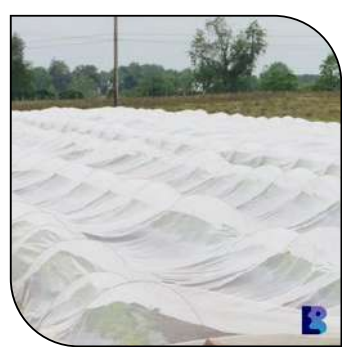
Non woven UV treated ground cover is a landscaping fabric designed to prevent weed growth while allowing water and air passage.