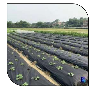
Non woven weed control fabric is a type of fabric that is designed to suppress the growth of weeds in gardens, landscapes, and other outdoor spaces.