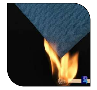
Non woven flame retardant fabric is a material that has been chemically treated to make it resistant to fire. Flame retardant fabric is one of the grades of nonwoven fabric.