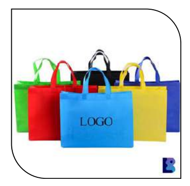
These are an attractive alternative to single-use plastic bags because they are durable, lightweight, and can be reused multiple times.