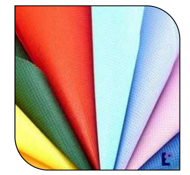
The non-woven fabric can be made in different colors by using pigments to dye the fibres before they are bonded together, producing a wide variety of colors and patterns.