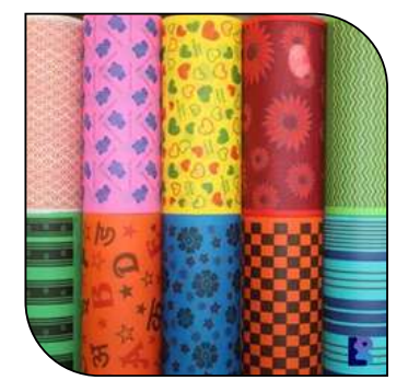
Our printed fabrics are made with the finest nonwoven fabrics and are finished with a high degree of detail. Our innovative printing process can create custom-looking fabrics that will suit any respect.