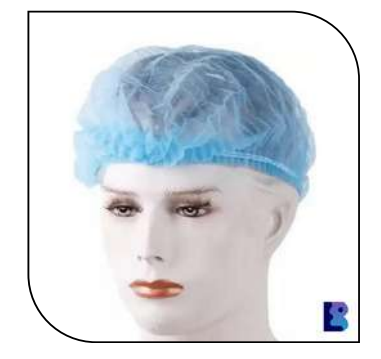
Non woven surgical caps are an integral part of personal protective equipment (PPE) worn by healthcare professionals during surgical procedures.