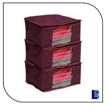
Non woven saree, salwar, and dress covers are lightweight yet durable material that offers excellent protection for these garments.