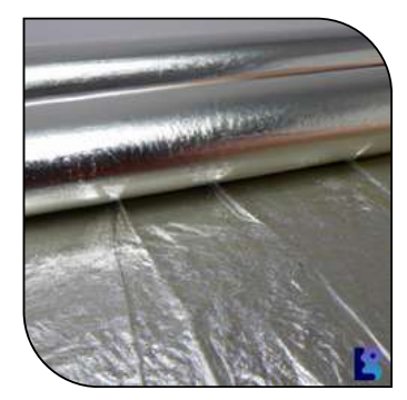
Aluminum foil laminated non woven fabric contain of a non-woven layer that has been coated with or laminated using aluminum foil.