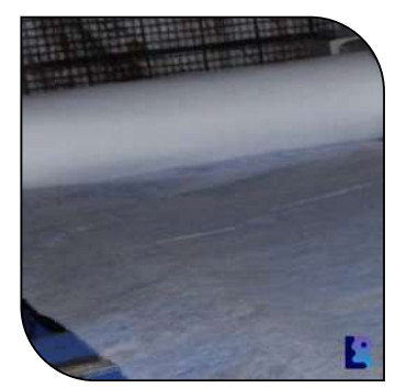
Embroidery backing non woven fabric is a material used to support and embroidery stabilize designs during stitching. It be composed can of synthetic fibers or a blend of both chemically or thermally bonded together.