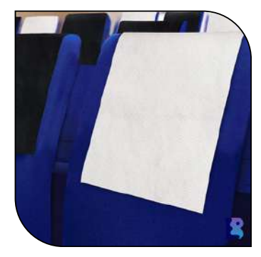
Non woven headrest covers are lightweight, breathable and disposable coverings designed to shield car seats and upholstery from dirt and environmental elements.