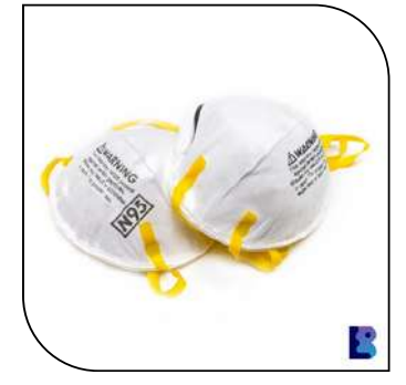
An N95 disposable face mask is personal protective equipment (PPE) designed to filter out at least 95% of airborne particles, such as bacteria and viruses.