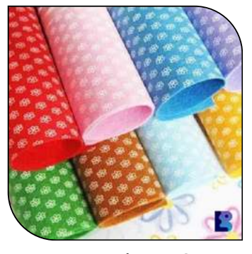
BOPP Laminated Non woven Fabric provides strength and allows them to handle massive weight. BOPP Laminated Fabric can be used for packing. The fabrics are available in various colours, sizes. widths. lengths, and thicknesses based on the diverse requirements of customers.