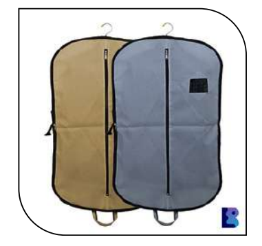
Non woven suit covers are a type of protective cover used to store and safeguard suits from dust, moisture, and other environmental elements.