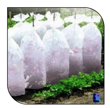
Non woven plant covers provide wind, frost and rain protection for plants. Furthermore, these barriers allow air, light and moisture to pass through so plants can grow healthy and strong.