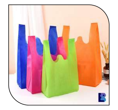
W-Cut non woven bags are reusable shopping bags made of fabric material. Their "W" shape handles provide added strength and durability, as they have been cut in a "W" pattern for added strength and durability.

D-cut Non Woven Bags are eco-friendly products made of spunbonded polypropylene (PP) fibers. These bags feature an innovative D-cut handle design integrated into the top, creating two handles to carry with ease.