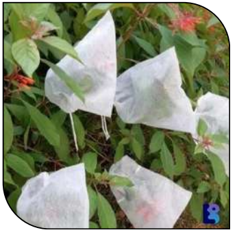
Use a non-woven fruit protection cover to secure your fruit or plant and ensure it remains healthy and flourishes. These covers will help ensure your product remains vibrant and thrives.